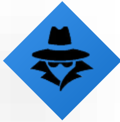
Armour Infosec Certified Ethical Hacking Penetration Testing Expert