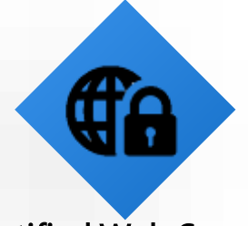
Certified Web Security Expert