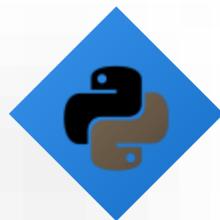
Python for Hackers