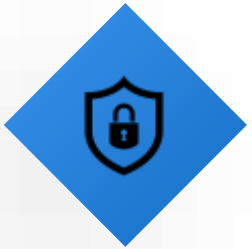
Certified Information Security Expert