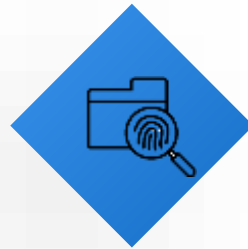
Armour Infosec Certified Computer Hacking & Forensic Expert