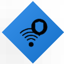
Certified Wireless Security Expert