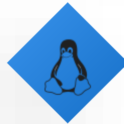
Certified Linux Server Administrator